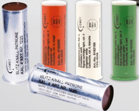
Parachute Signal Cartridges